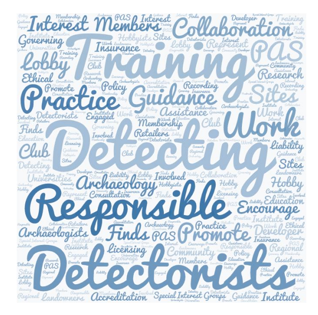
Figure 1 What role should an Institute of Detectorists take? Word cloud taken from Focus Group responses.